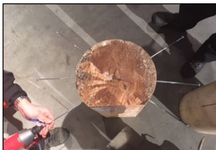
Underhand: three screws to the left and 3 screws to the right on both sides. In total 12 screws.