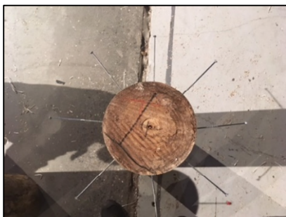
Standing Block (on top): 8 screws / Springboard (on top): 6 screws